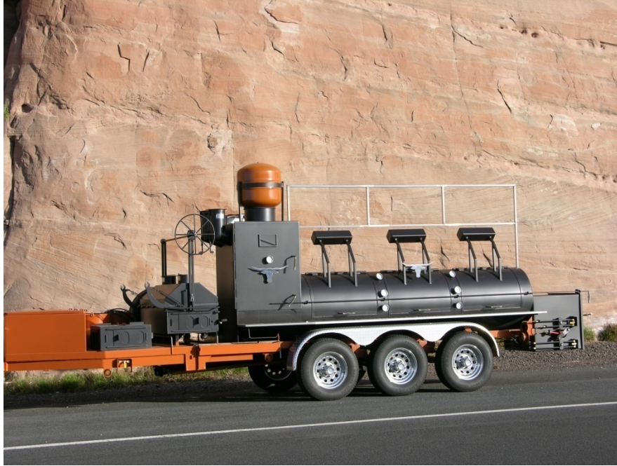
“The Extended 30 by 10 Foot Ultimate Cook-off & Catering Rig”

Approx. COOKING CAPACITY~100 SQUARE FEET~FEEDS about (800-1,000) ( Add on Options Can be Purchased Singularly) Price List for 2016