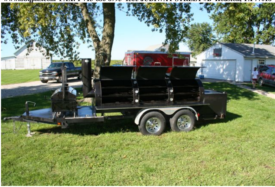
The Gary Maines Mobile "CATERING WAGON" Trailer: 19ft by 7ft with Optional Log Rack / Approx. Capacity 90 Sq. Ft. & Feeds about 900. Add an Upright Slow Smoker with 4 Row Pullout Shelves & Pop Baffle Kit Shown w/Optional Chrome Fenders, Spare Tire, Sliding 2ft x 4ft Steak Grill on Nose

BBQ Pits by Klose 1-713-686-8720 For Pictures Email: david@bbqpits.com 1-800-487-7487 www.bbqpits.com FAX: 1-713-686-8793 1355 JUDIWAY STREET #B Houston, TX 77018