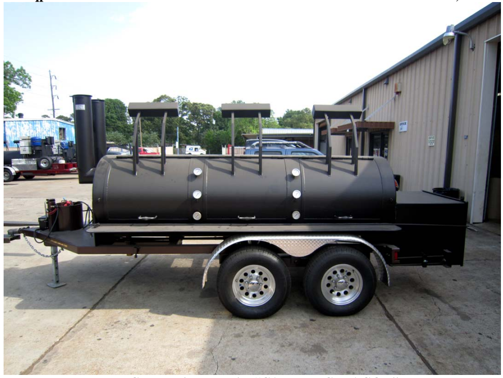
The Gary Maines Mobile "CATERING WAGON" Trailer: 19ft by 7ft with Optional Log Rack /Approx. Capacity 90 Sq. Ft. & Feeds about 900. Add an Upright Slow Smoker with 4 Row Pullout Shelves & Pop Baffle Kit Shown w/Optional SS Table, Chrome Fenders, Spare Tire, Sliding 2ft x 4ft Steak Grill on Nose

BBQ Pits by Klose 1-713-686-8720 For Pictures Email: david@bbqpits.com 1-800-487-7487 www.bbqpits.com FAX: 1-713-686-8793 1355 JUDIWAY STREET #B Houston, TX 77018