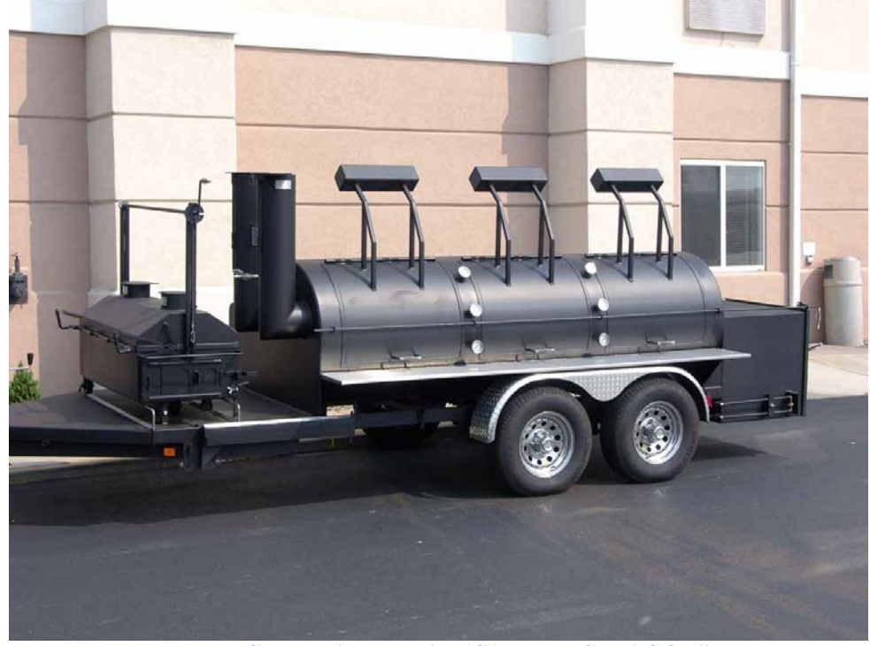
The Gary Maines Mobile "CATERING WAGON" Trailer: 19ft by 7ft with Optional Log Rack /Approx. Capacity 90 Sq. Ft. & Feeds about 900.

BBQ Pits by Klose 1-713-686-8720 For Pictures Email: david@bbqpits.com 1-800-487-7487 www.bbqpits.com FAX: 1-713-686-8793 1355 JUDIWAY STREET #B Houston, TX 77018