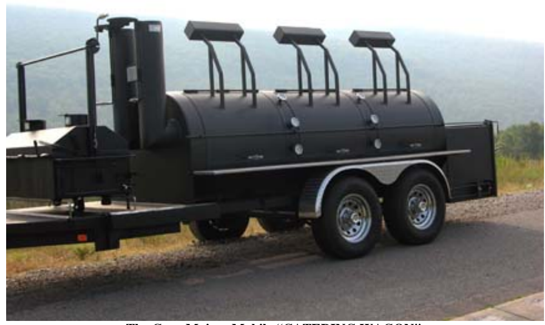
The Gary Maines Mobile "CATERING WAGON" Trailer: 19ft by 7ft with Optional Log Rack / Approx. Capacity 90 Sq. Ft. & Feeds about 900. Add an Upright Slow Smoker with 4 Row Pullout Shelves & Pop Baffle Kit Add on Options Can be Purchased Singularly.

BBQ Pits by Klose 1-713-686-8720 For Pictures Email: david@bbqpits.com 1-800-487-7487 www.bbqpits.com FAX: 1-713-686-8793 1355 JUDIWAY STREET #B Houston, TX 77018