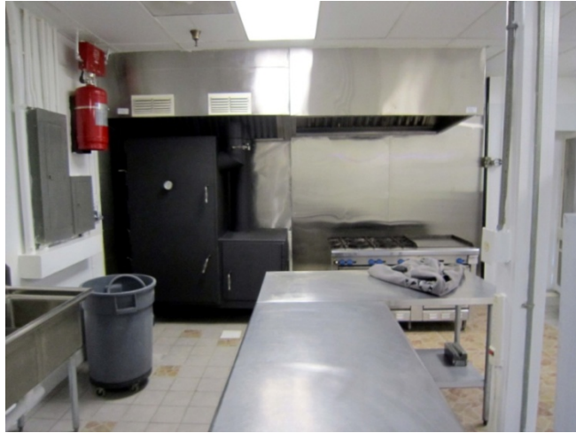
42"x42" Main Chamber with 42 x42 Double Walled & Insulated Firebox Approx. COOKING CAPACITY: ~74 SQUARE FEET~

All Uprights Below are Six Foot Six Inches Tall and Have Six Racks Inside Minimum ALL NEW PRICING STRUCTURE WITH MORE SHELVING & Square Footage for 2016