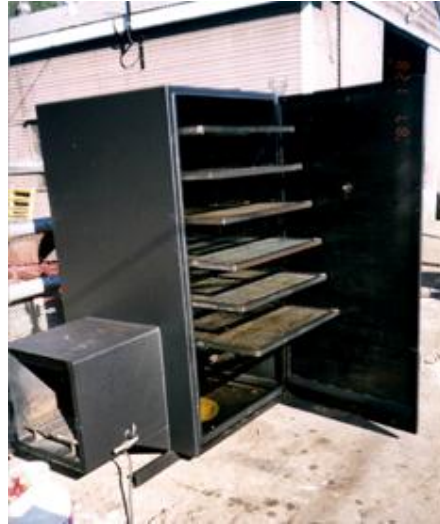
42"x42" Main Chamber with 42 x 42 Double Walled & Insulated Firebox Approx. COOKING CAPACITY: ~74 SQUARE FEET~

BBQ Pits by Klose 1-713-686-8720 For Pictures Email: david@bbqpits.com 1-800-487-7487 www.bbqpits.com FAX: 1-713-686-8793 1355 JUDIWAY STREET #B Houston, TX 77018 USA