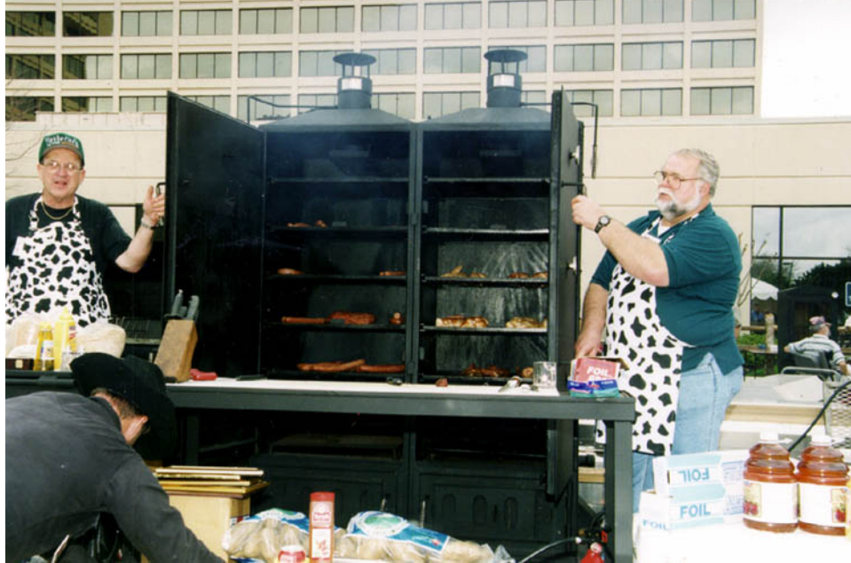
48" x 60" Main Chamber with 36 x42 Double Walled & Insulated Firebox Approx. COOKING CAPACITY: ~120 SQUARE FEET~

BBQ Pits by Klose 1-713-686-8720 For Pictures Email: david@bbqpits.com 1-800-487-7487 www.bbqpits.com FAX: 1-713-686-8793 1355 JUDIWAY #B Houston, TX 77018 USA