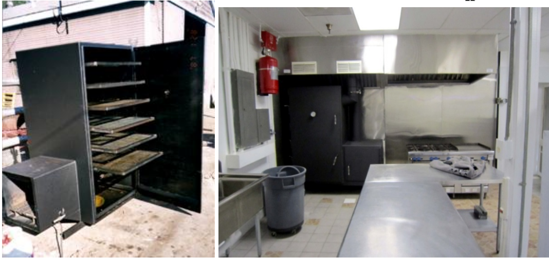
48"x48" Main Chamber with 48 x48 Double Walled & Insulated Firebox Approx. COOKING CAPACITY: ~96 SQUARE FEET~

BBQ Pits by Klose 1-713-686-8720 For Pictures Email: david@bbqpits.com 1-800-487-7487 www.bbqpits.com FAX: 1-713-686-8793 1355 JUDIWAY STREET #B Houston, TX 77018 Quarter Inch Steel or Double Wall Insulated also Available. 2016 Price Sheet 1-713-686-8720 Fax: 1-713-686-8793 1-800-487-7487 Email: david@bbqpits.com