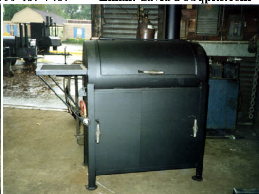
20x42 Klose Catering Grill with enclosed log rack SS handles/ On 4 wheels or legs/ 1645.00 meat racks framed in steel angles for strength. Fixed side table. Option for removable front table for 85.00, & table Available in SS for 450.00