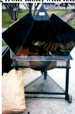
Uniquely Shaped Grills For the artist in all of Us. Pyramid Cooker 1695.00