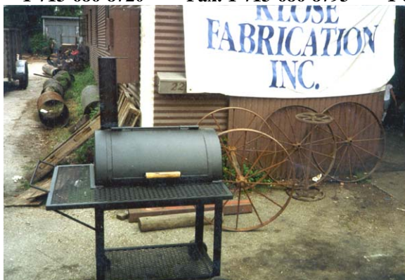
20x30 Owner Preferred Klose Grill 850.00 Pullout Ash Pan, SS handles, meat racks framed in steel angles for strength. On four heavy duty wheels/log rack. folding front table, with fixed side table.

Any Grill or Smoker can have a Fish Fryer Table Outside & Hot Griddle Plate 1-713-686-8720 Fax: 1-713-686-8793 1-800-487-7487 Email: david@bbqpits.com