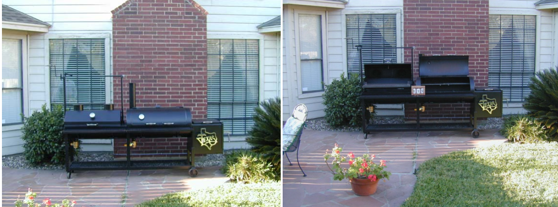
The Extended COOK'S & CHEF'S COMBO GRILL & SMOKER 20" X 42" Smoker & 20" X 42" Steak Grill with Hood 5350.00

Any Grill or Smoker can have a Fish Fryer Table Outside & Hot Griddle Plate 1-713-686-8720 Email: david@bbqpits.com