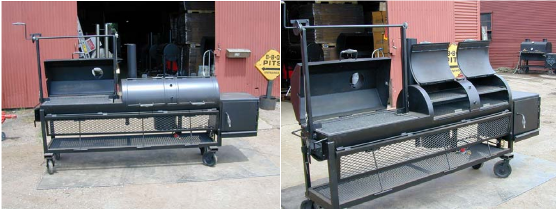
The Extended COOK'S & CHEF'S COMBO GRILL & SMOKER 20" X 42" Smoker & 20" X 42" Steak Grill with Hood 5350.00

Any Grill or Smoker can have a Fish Fryer Table & Hot Griddle Plate 1-713-686-8720 Email: david@bbqpits.com