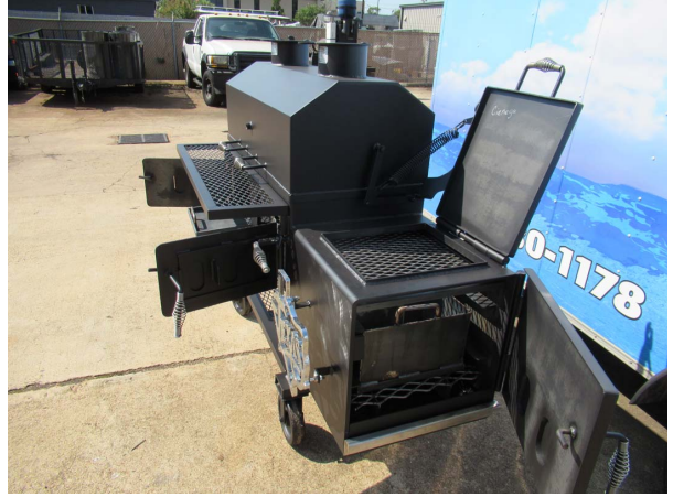
160,000 BTU Fish Fryer Table ALSO AN OPTION. (add 750.00) Includes 160,000 BTU Cast Iron Burner, swivel Bottle Holder, Hose & Regulator. {Front controls included}. Bottle not included as it cannot be shipped safely. Add a Fold Down Hot Griddle Plate for 245.00

CHROME STATE OF TEXAS STAR. Looks Great Mounted. 1/2" Thick Steel Plate State of Texas