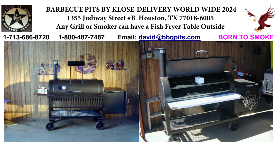
The 20" x 48" Deluxe One or Two Door Smoker is One of the All Time Favorites 2995.00 CAPACITY: 1920 Sq inches in Smoker and 400 Sq. inches for Grilling inside the Firebox (Shown with Optional Counterweighted Door 145.00 Recommended with ½" Firebox. Right photo shows optional SS Table, State of Texas. WEIGHT 800# with ¼" Firebox, and with 1/2" Firebox is 1025#

This pit has a main chamber 20"inch diameter by 48" long x true ¼" Thick New Steel. Adjustable air-intake & smokestack controls. Ideal for grilling & smoking. Stainless Steel air-cooled handles, removable side table, front folding table.