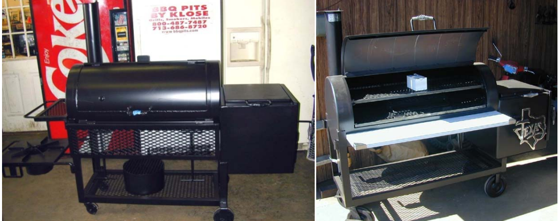
The 20" x 48" Deluxe One or Two Door Smoker is One of the All Time Favorites 2995.00 CAPACITY: 1920 Sq inches in Smoker & 400 Sq. inches for Grilling in Firebox. Top Right Photo Shows FREE 2 Row Pullout Out Shelves (a 400.00 Value)

Any Grill or Smoker can have a Fish Fryer Table Outside 1-713-686-8720 1-800-487-7487 Email: david@bbqpits.com