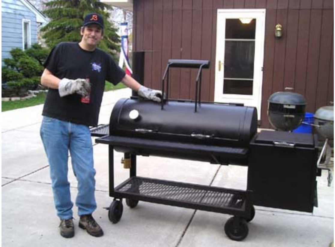
(Shown here with Optional Counterweighted Door 145.00-Recommended for the 2 Row Pullout Shelves)