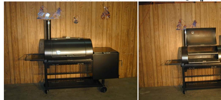
The Huge 24" x 42" Deluxe One Door Smoker-All Time Favorite 3775.00 CAPACITY: 14 sq. ft. in Smoker & 4 sq. ft. for Grilling in Firebox. Weight 850# with 1/4" Firebox, 1050# with 1/2" Firebox

BARBECUE PITS BY KLOSE-DELIVERY WORLD WIDE for 2024 Any Grill or Smoker can have a Fish Fryer Table & Hot Griddle Plate 1-713-686-8720 1-800-487-7487 Email: david@bbqpits.com